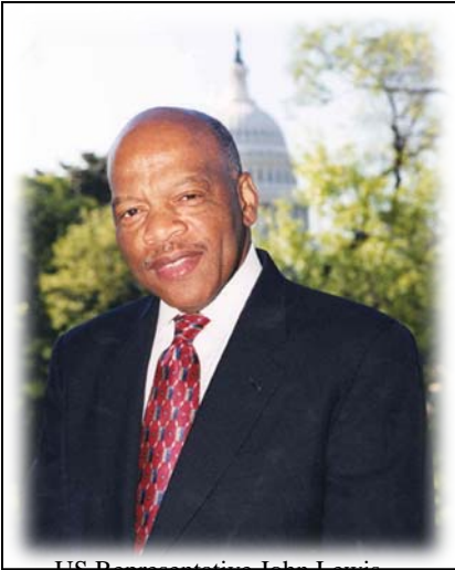
US Representative John Lewis.

On March 7th, 1965, 600 of us lined up to walk from Selma to Montgomery, to march for voting rights. When we tried to cross the Edmund Pettus Bridge over the Alabama River, we were met by state troopers. They attacked us with tear gas, bullwhips, and nightsticks.